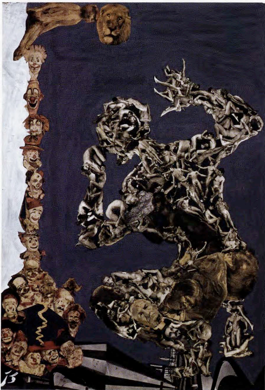
The Mouse's Tale , by Jess © The Jess Collins Trust, Berkeley, Calif. and San Francisco Museum of Modern Art, Calif. Gift of Frederic P. Snowden

What happens when an allusion goes unrecognized? A closer look at The Waste Land may help make this point. The body of Eliot's poem is a vertiginous mélange of quotation, allusion, and "original" writing. When Eliot alludes to Edmund Spenser's "Prothalamion" with the line "Sweet Thames, run softly, till I end my song," what of readers to whom the poem, never one of Spenser's most popular, is unfamiliar? (Indeed, the Spenser is now known largely because of Eliot's use of it.) Two responses are possible: grant the line to Eliot, or later discover the source and understand the line as plagiarism. Eliot evidenced no small anxi-